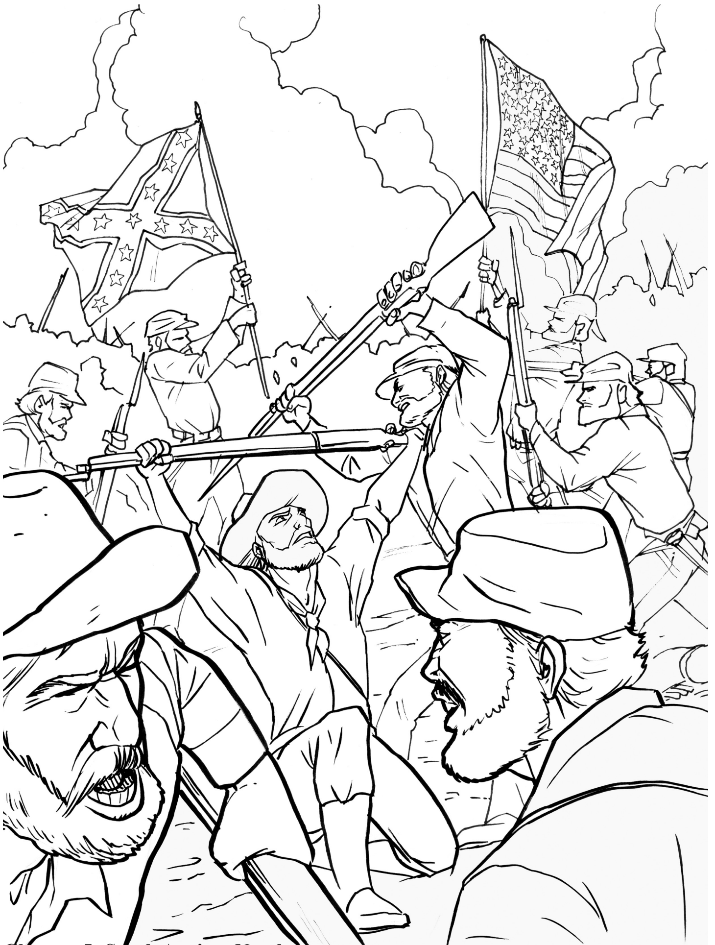
Chapter 5: South Against North For four years, the northern and southern parts of the United States fought each other. The northern or “Union” soldiers wore blue, and the southern or “Confederate” soldiers wore gray.