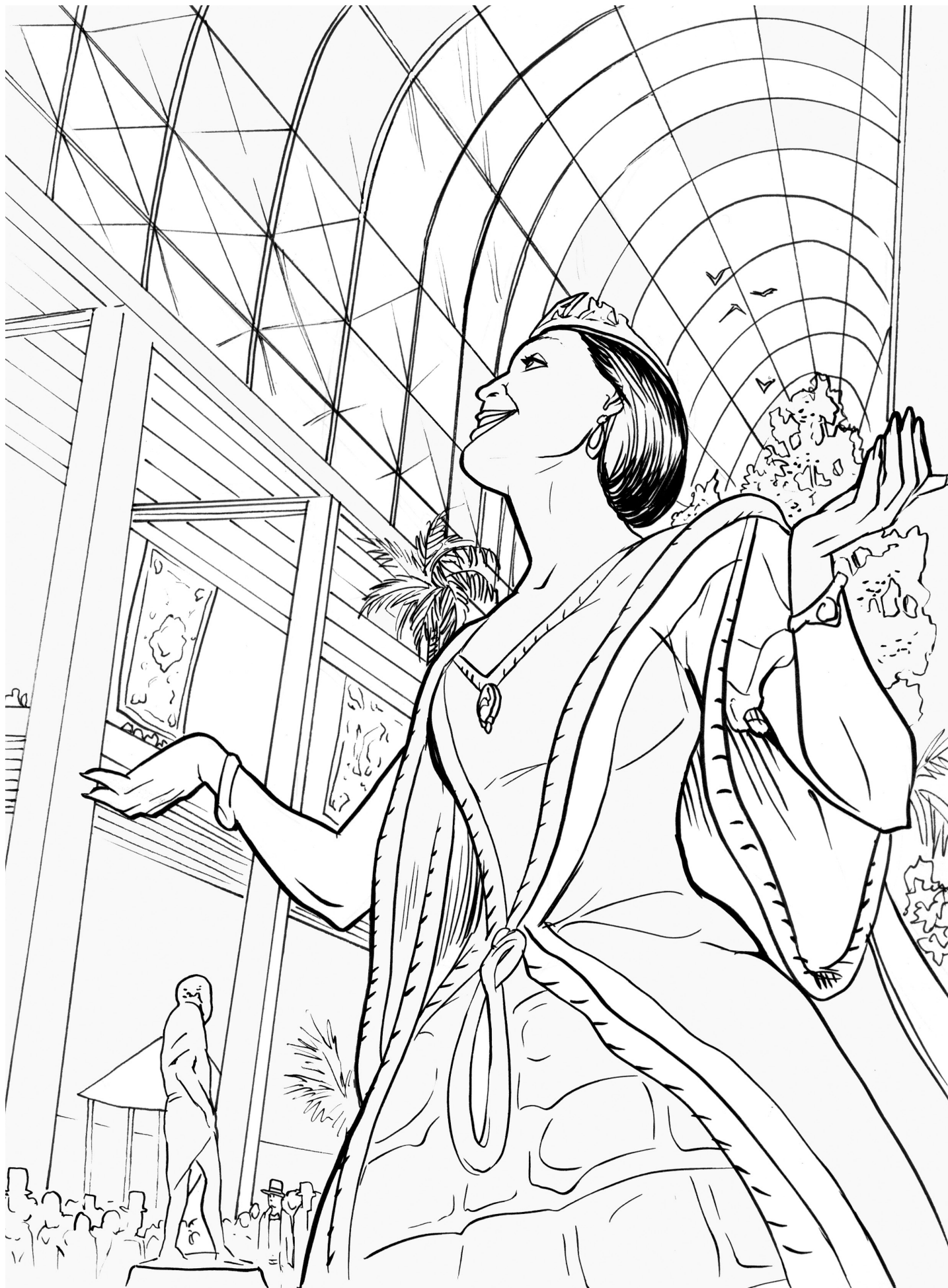
Chapter 1: Queen Victoria at the Great Exhibition Britain hosted the Great Exhibition in a giant building made of glass. Countries from around the world used the Exhibition to show off their amazing new inventions, such as steam trains.