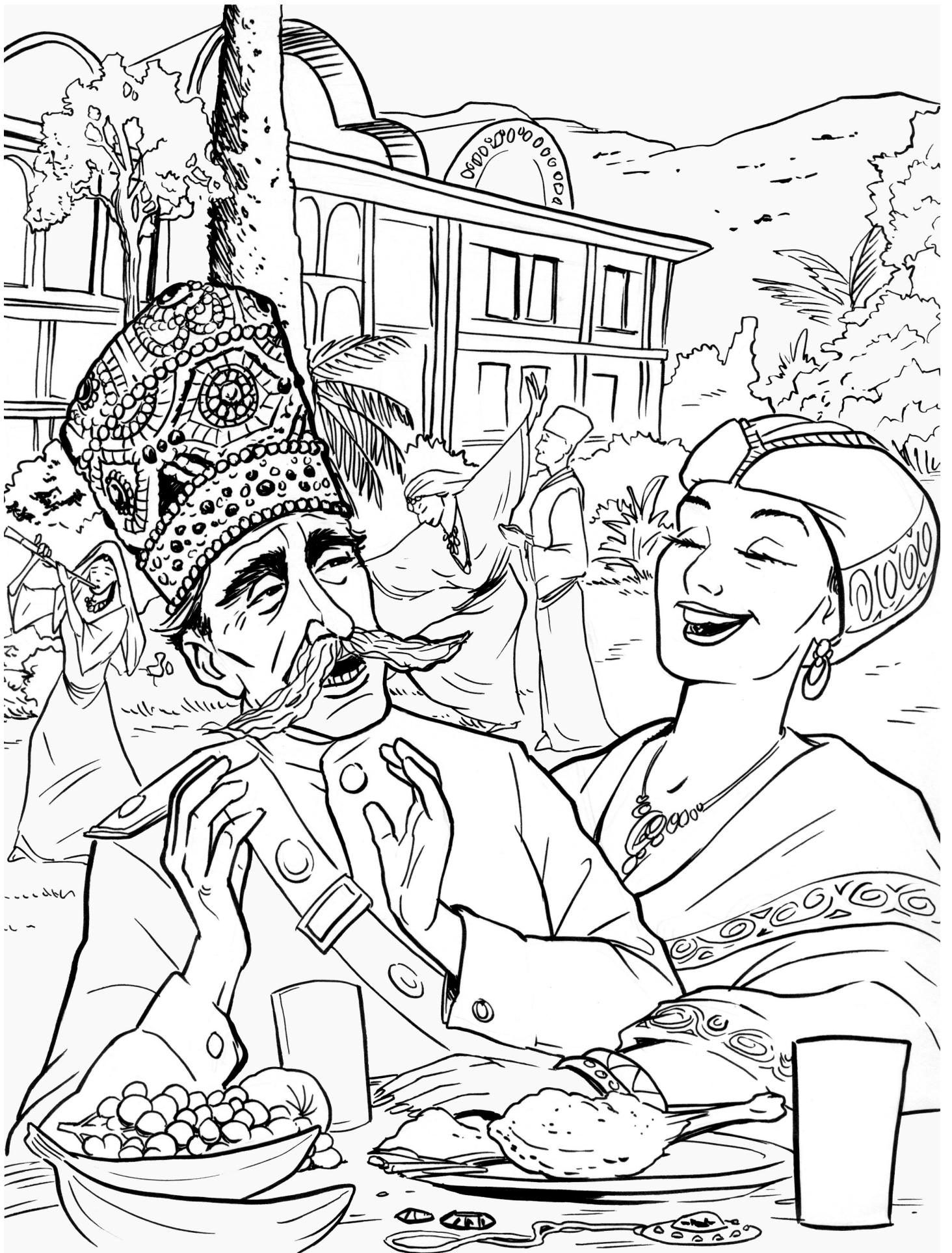
Chapter 18: The Rich Ruler Mozaffar od-din Shah, the ruler of Persia, spent too much of his country's money on fancy parties, beautiful clothes, and expensive jewels.