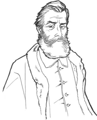
Merchant and explorer, Marco Polo

Marco Polo was amazed by the beautiful clothes that the Chinese people wore, by the abundance of fresh meat and vegetables in the Chinese markets, and by the size of the fruit. “Certain pears of enormous size,” he wrote, “weigh as much as ten pounds each.” And he was astounded to see fires made out of black rocks that burned. Marco Polo had never seen coal before!